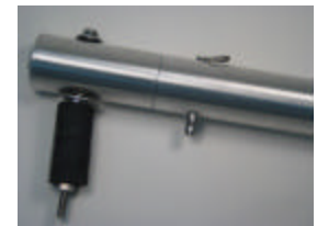
Quick-Detach Kit ™

We have added a NEW EZ-ON EZ-OFF ™ 2-Piece option to our Schedule 40 and Schedule 80 Aluminum Davits. This option allows the easy removal of the Power Head and upper davit assembly. Our EZ-ON EZ-OFF ™ 2-Piece davits and Quick-Detach ™ units are fabricated using a solid inner shaft making an extra strong, bulletproof joint . The 2-Piece joint is completely internal and is nearly invisible. The 2-Piece davit cuts down on the extra-length shipping costs of the standard single piece davit. To make installation even simpler, we have added an optional