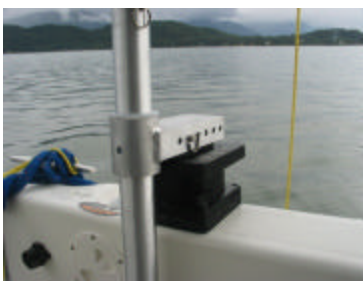
EZ-Scotty ™ Mount

DoubleDecker ™ pre-drilled and tapped mounting plate. This mounting plate can be attached directly to the vessel surface with appropriate hardware. Then using screws provided, the Gunnel and Kick-plate brackets may be attached to it. The mounting plate can also be used as a backing plate on vessel installations requiring one.