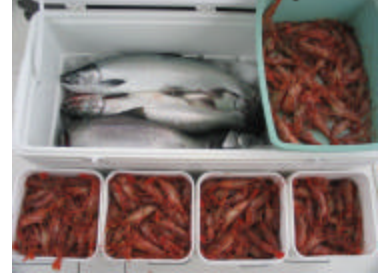
Nice CATCH of the day!