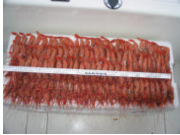
How about a LOT of SPOTS!