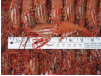
How about some SPOTS?

What do our customers think? Well, if repeat customers are any indication – we have had many repeat customers – coming back not once, not twice, not three times, but as many as four and more times to get more of those Super Magnum-Shrimper™ pots! How well do they work? Well, pictures tell a 1000 words!